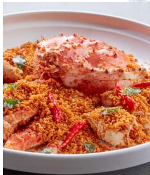
避风塘炒蟹 Stir-Fried with Garlic and Dried Chilli