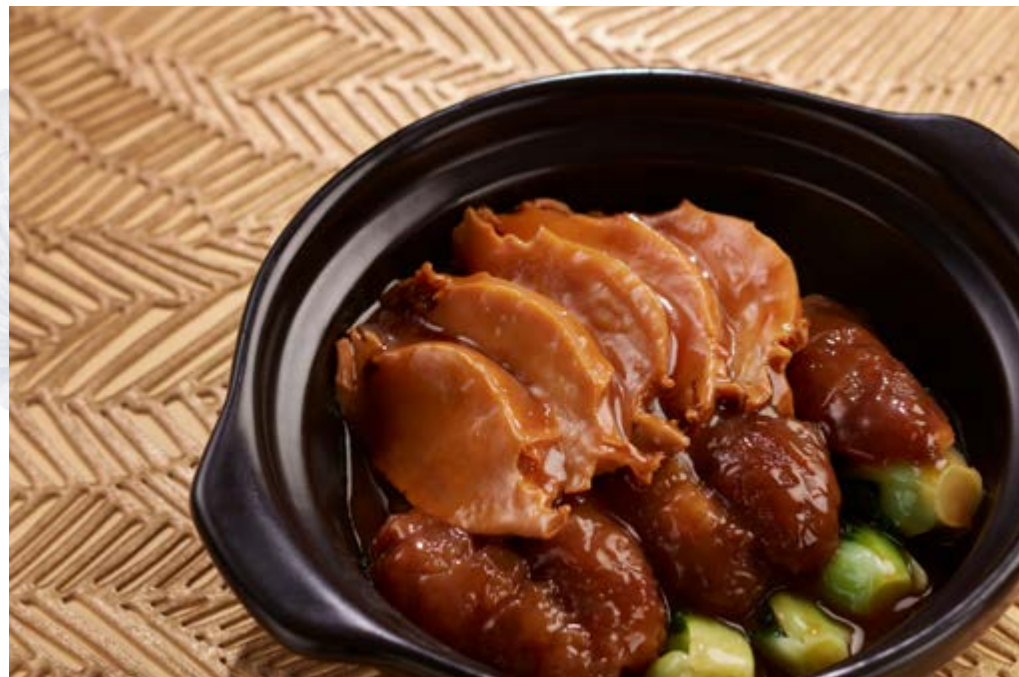
特级墨西哥鲍片海参煲 Braised Sliced Abalone with Sea Cucumber served in Claypot