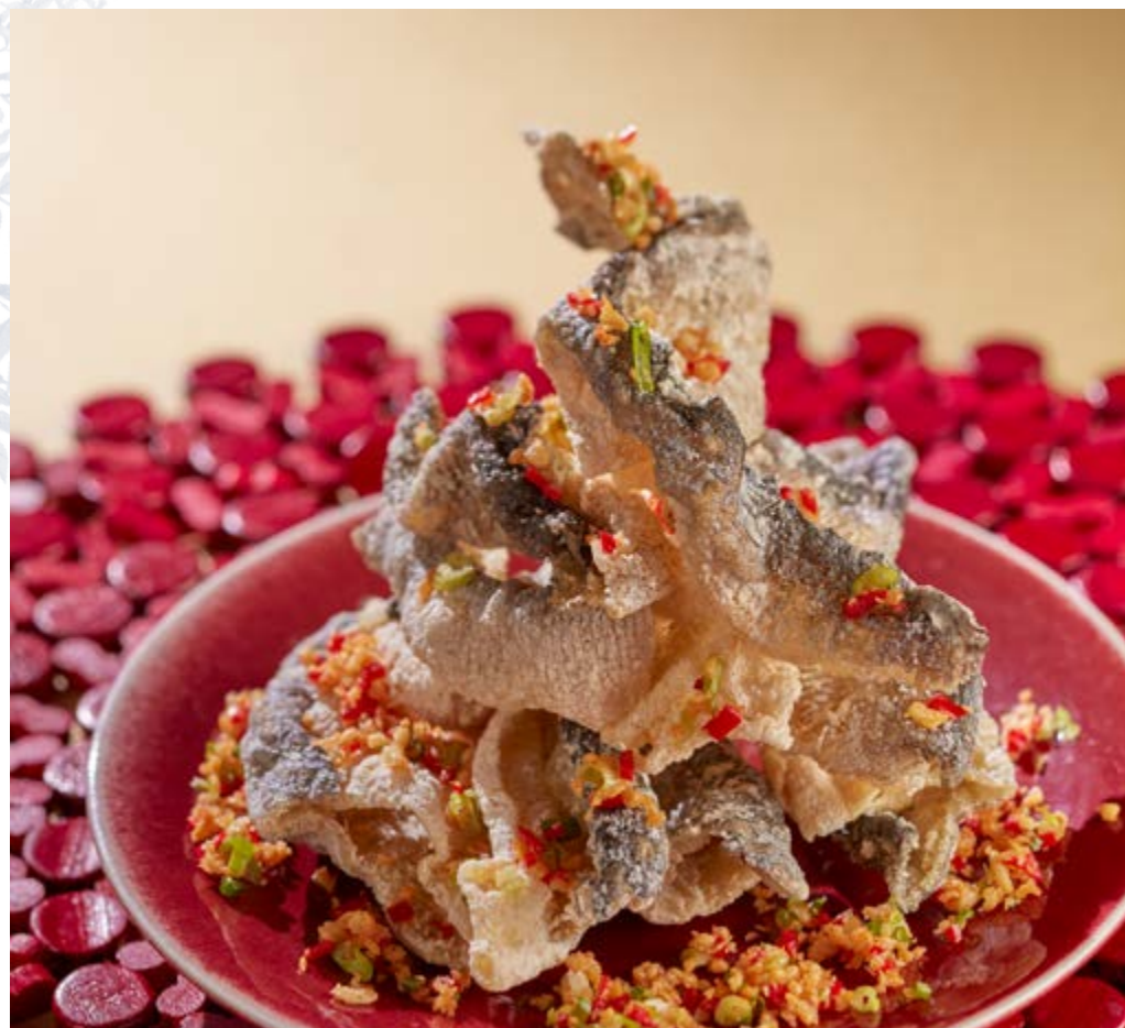
椒盐鱼皮 Fish Skin with Salt and Pepper