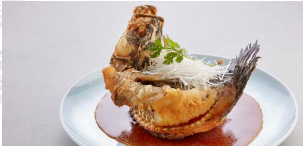
油浸笋壳鱼 Deep-Fried Marble Goby (Soon Hock) with Superior Soya Sauce

Live seafood prices fluctuate daily. Red House strives to serve the freshest produce at the fairest price. Please check with our friendly crew for seasonal prices.