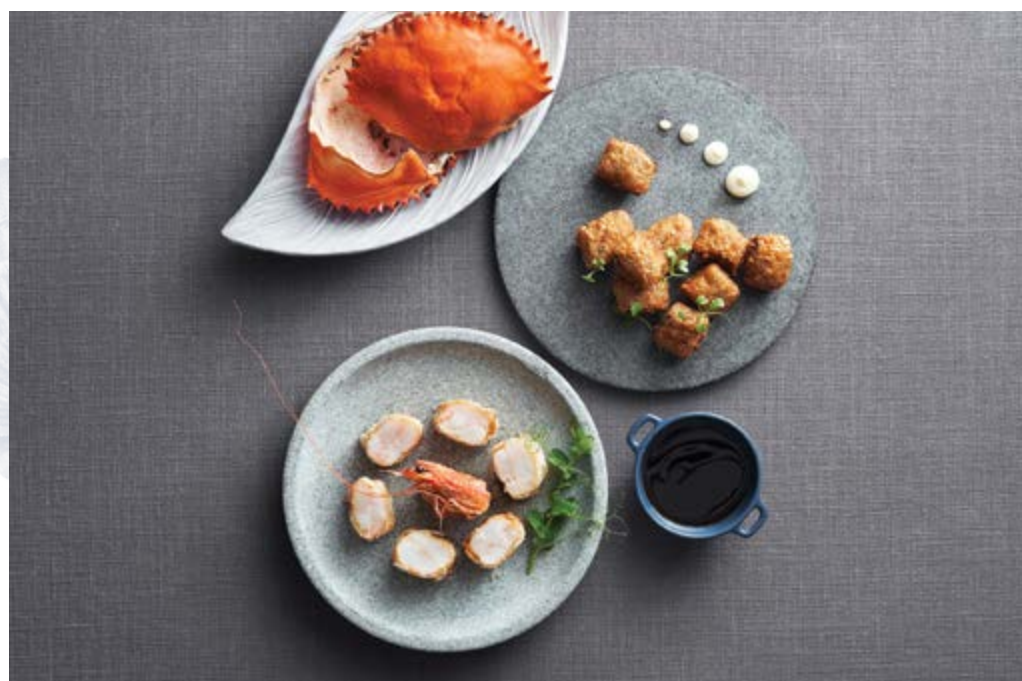
蟹肉虾枣, 客家虾枣 Crab Meat Prawn Roll, Hakka Prawn Roll