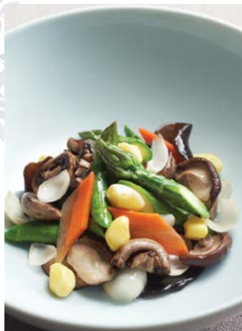
罗汉上素 Vegetarian Delight