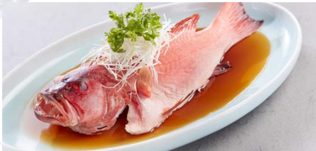
清蒸星斑鱼 Steamed Star Grouper with Superior Soya Sauce