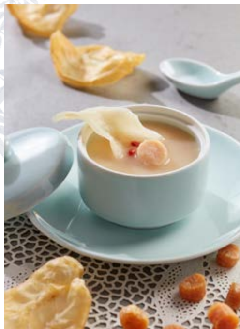
干贝花胶炖翅骨汤 Double-Boiled Cartilage Soup with Conpoy And Fish Maw

Small portion for individual consumption; Large portion recommended for 6 – 8 pax. 请注意小份供一位用，大份供六至八位用。