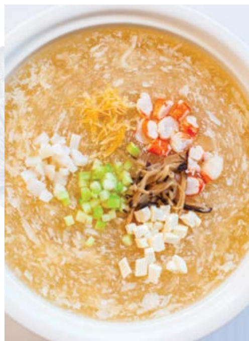
百花瑶柱羹 Seafood Soup