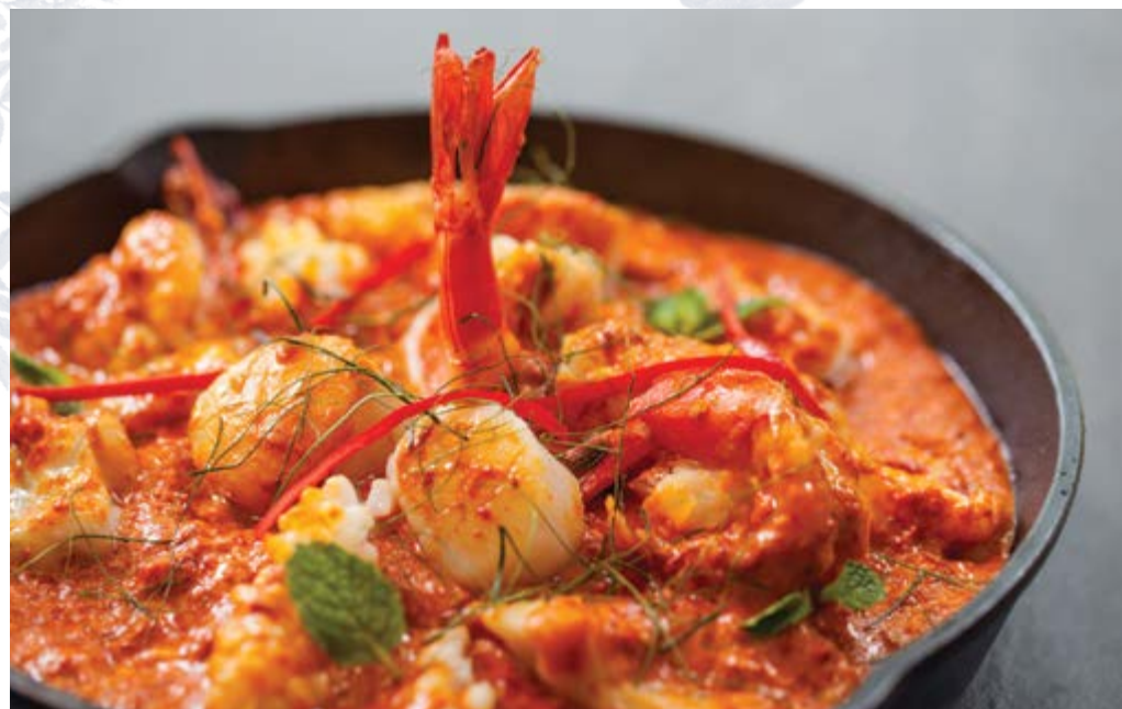
香辣海鲜 Spicy Seafood Combination