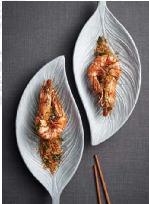
避风塘虾 Stir-Fried with Garlic and Dried Chilli