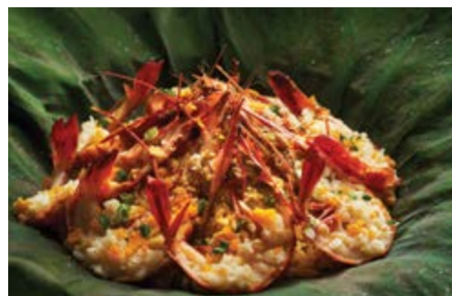
生虾荷叶炒饭 Lotus Leaf Fried Rice with Fresh Prawns