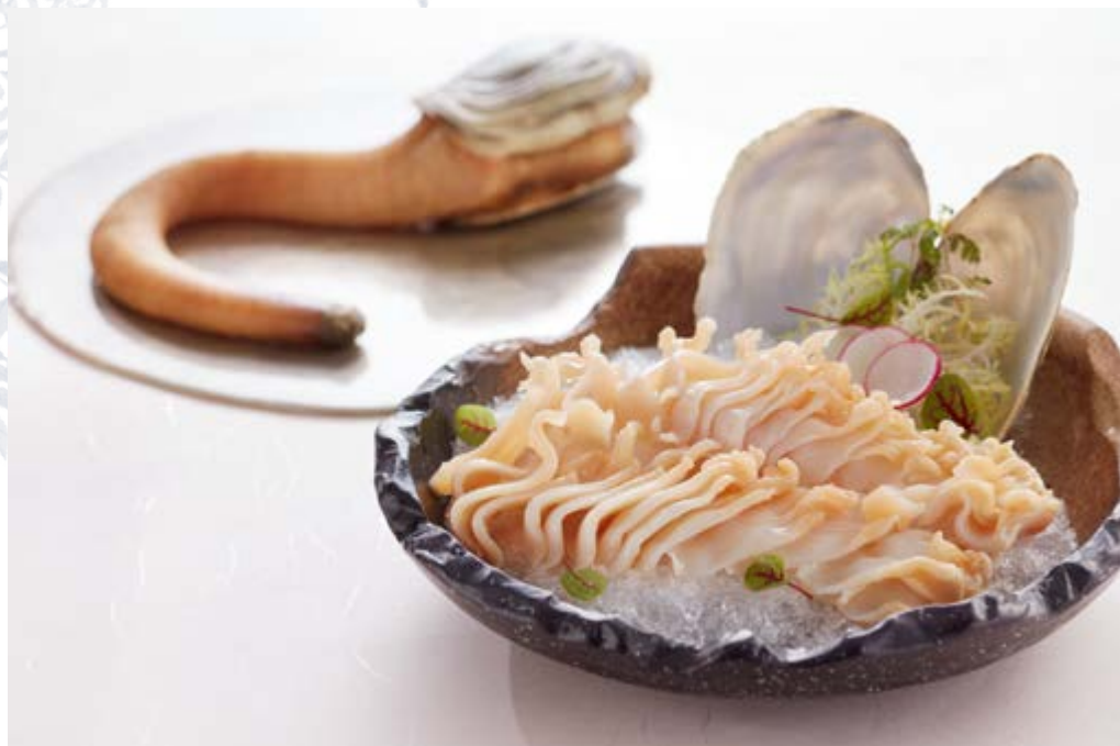
刺身象拔蚌 Geoduck Sashimi