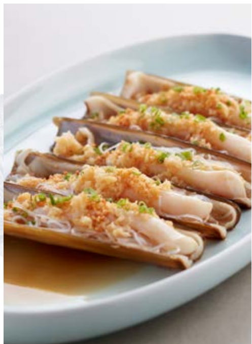
蒜茸蒸苏格兰竹蚌 Steamed Scottish Bamboo Clams with Minced Garlic and Vermicelli