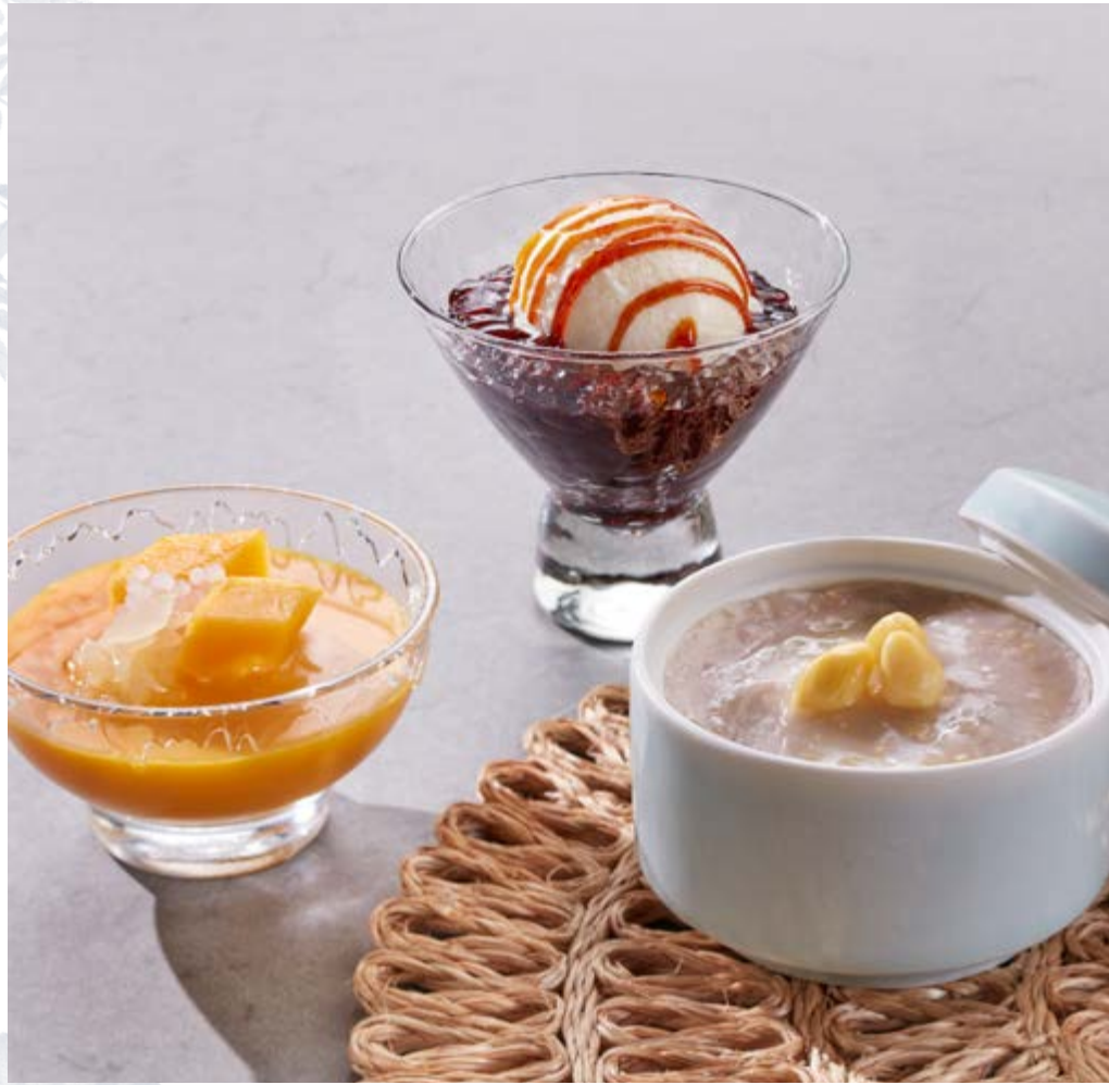
杨枝甘露，黑糯米配椰子雪糕，福果芋泥 Mango Purée with Sago and Pomelo, Black Glutinous Rice served with Coconut Ice Cream, Mashed Yam with Gingko Nuts