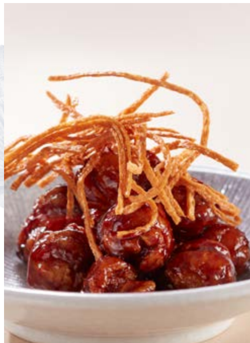
妈蜜鸡球 Marmite Chicken