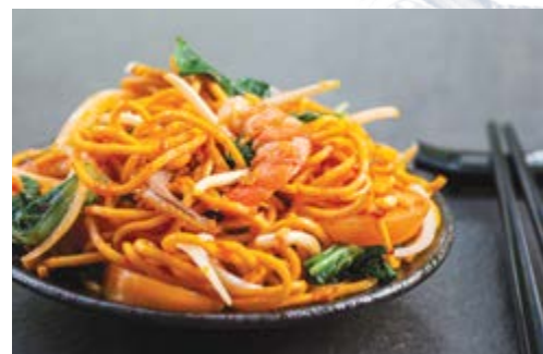
马来炒面 Seafood Mee Goreng