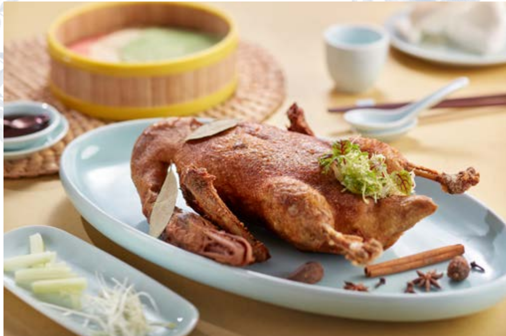
香酥全鸭 Crispy Duck Szechuan Style