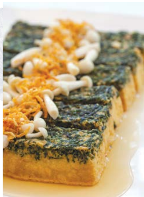
秘制松茸菇干贝菠菜豆腐 Braised Spinach Tofu and Honshimeji Mushroom topped with Crispy Conpoy