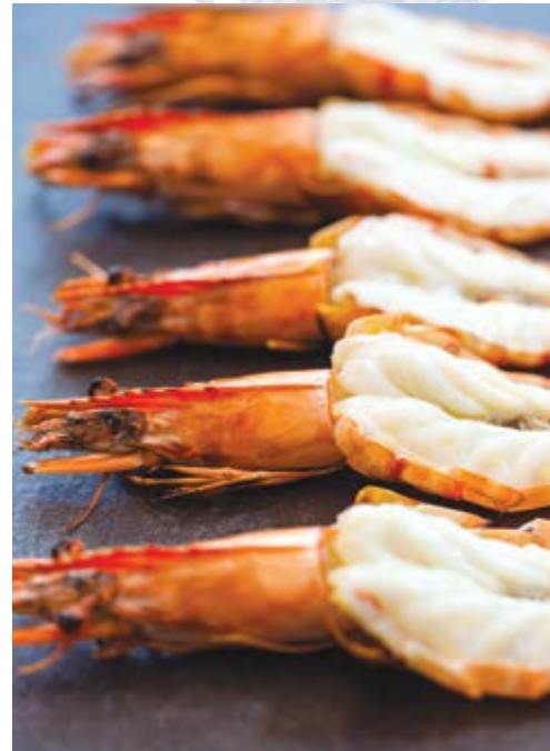
传统烧烤虾 Grilled (BBQ) Prawns