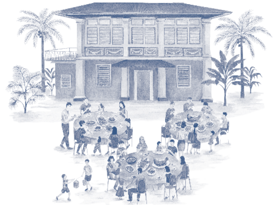
Grand Copthorne | Esplanade | Clarke Quay