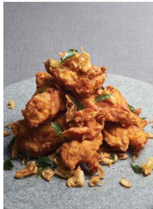
南洋风味鸡 Ayam Halia Goreng

所有价格均需加收 10% 服务费和现有政府消费税。照片仅供参考。 All prices are subject to 10% service charge and prevailing GST. Visuals shown are for illustration purposes only.