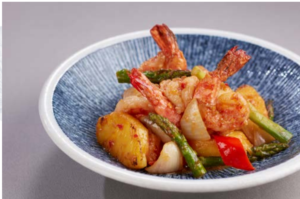
滋味马六甲虾 Prawns in Malacca Sauce