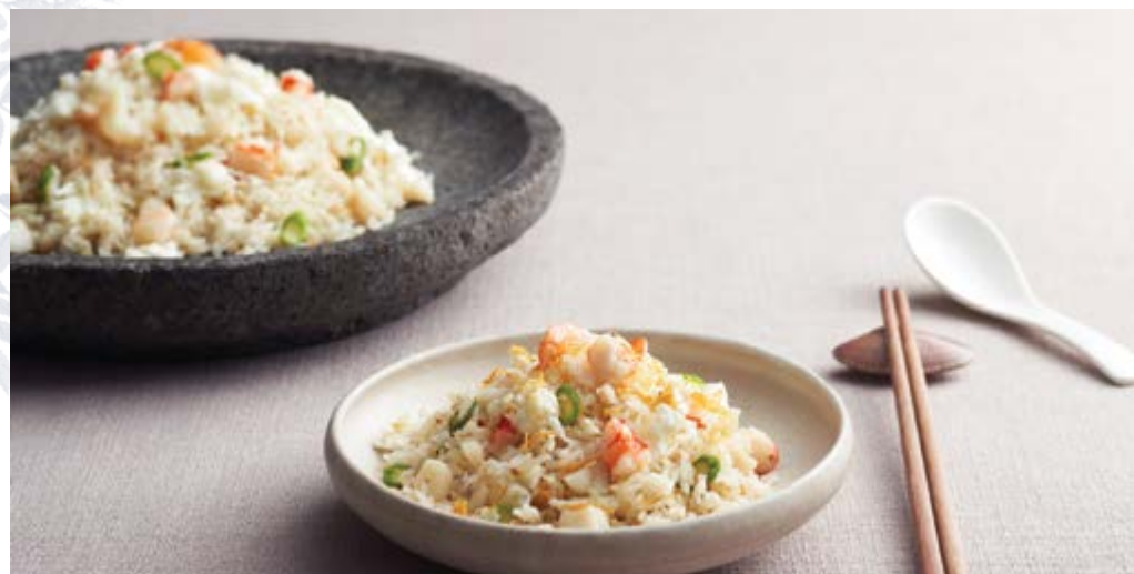
干贝蛋白炒饭 Scallop Egg White Fried Rice