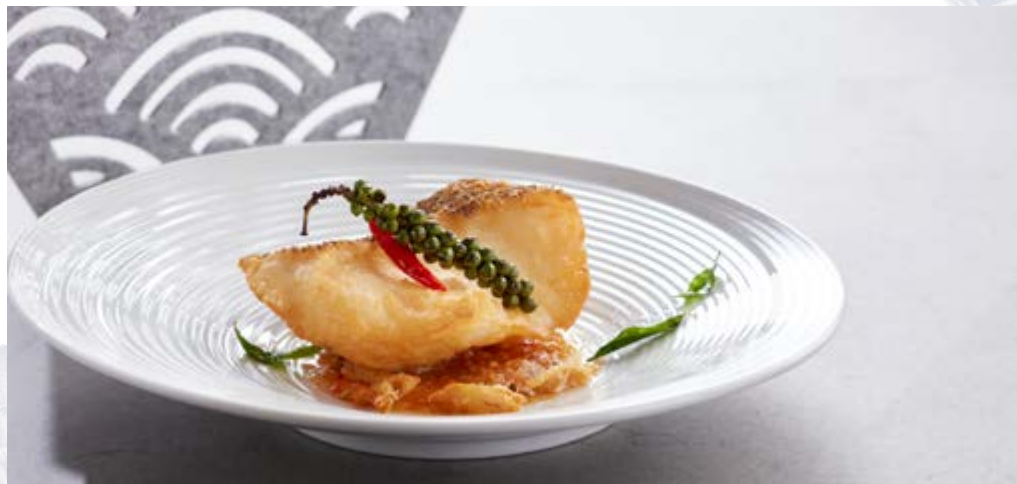
香茅清柠炸鳕鱼 Deep-Fried Cod in Lemongrass and Kaffir Lime