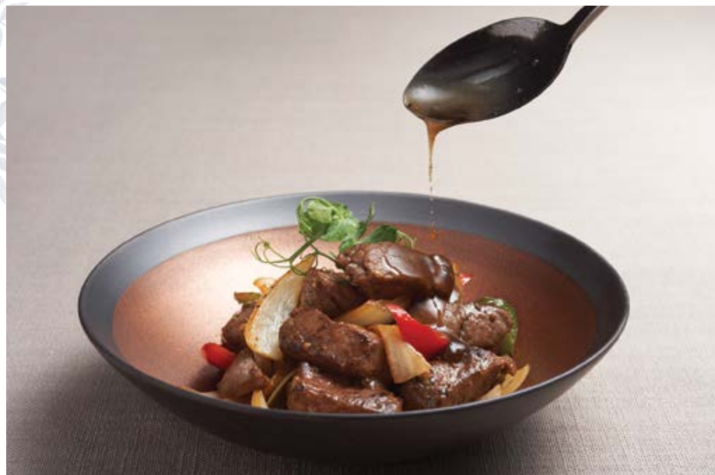
黑胡椒炒和牛柳粒 Sautéed Wagyu Beef Cubes with Black Pepper