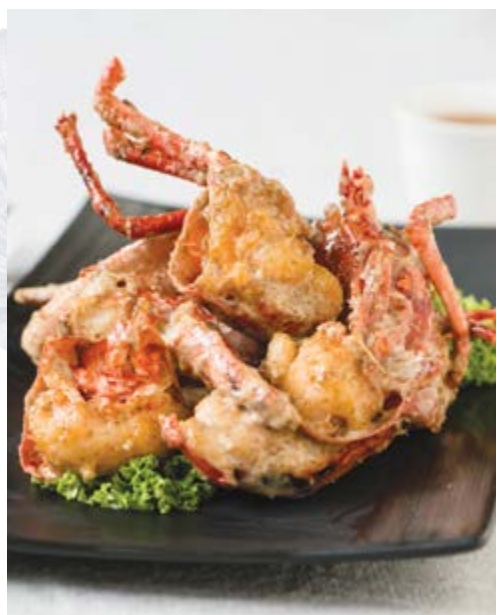
胡麻酱龙虾 Lobster in Sesame Sauce