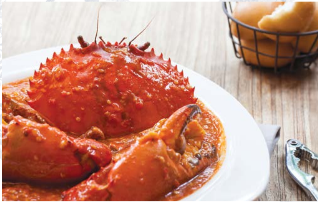
辣椒螃蟹 Red House Chilli Crab