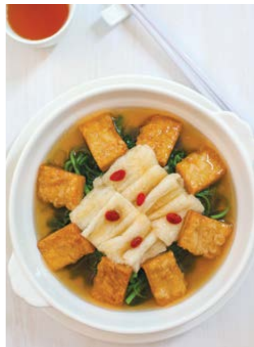
竹笙豆根扒时蔬 Braised Gluten Puff & Bamboo Pith with Seasonal Greens