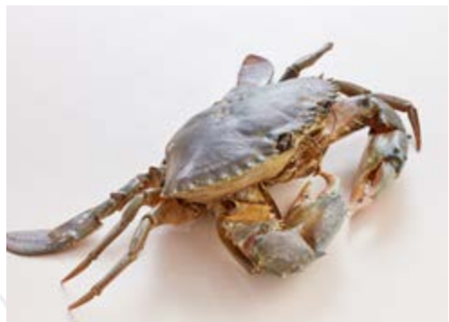
斯里兰卡蟹 A. Sri Lankan Mud Crab