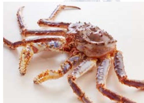
阿拉斯加帝皇蟹 B. Alaskan King Crab