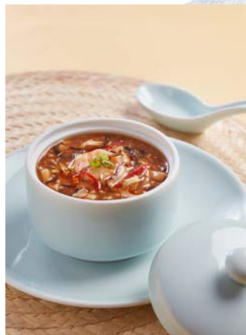
四川酸辣汤 Szechuan Hot and Sour Soup