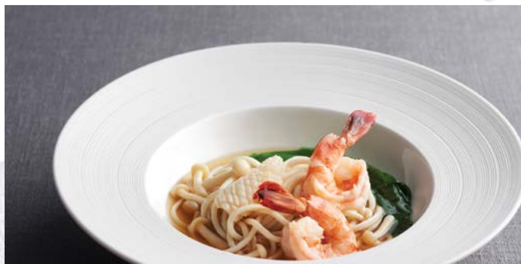
海鲜焖鱼茸面 Braised Fish Meat Noodle with Fresh Seafood