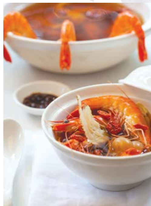
醉虾汤 Herbal Drunken Prawn Soup