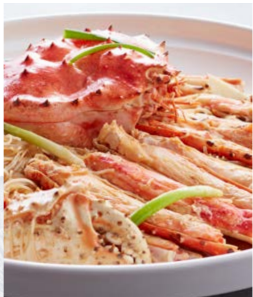
螃蟹焗双米粉 Braised with Dual Bee Hoon