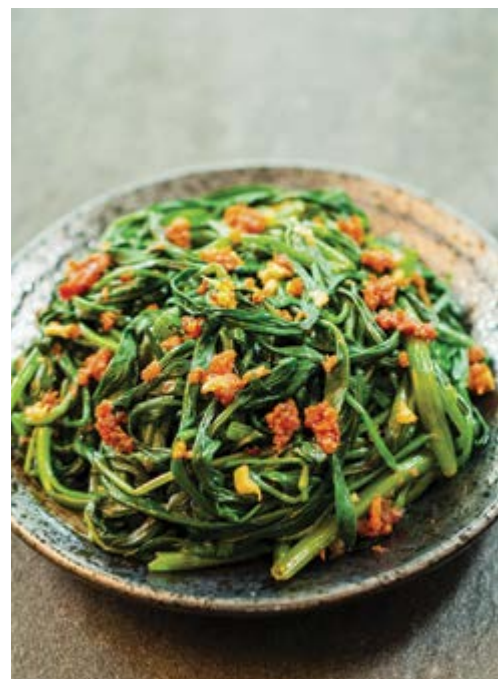
叁崙应菜 Sambal Kang Kong