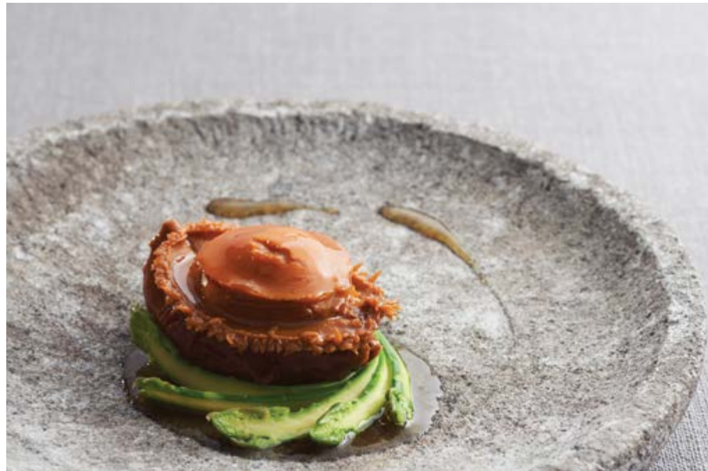
蚝皇焖特级墨西哥鲍鱼 Braised Whole Mexican Abalone with Premium Oyster Sauce