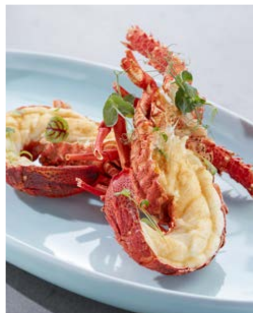
传统烧烤龙虾 Grilled (BBQ) Lobster