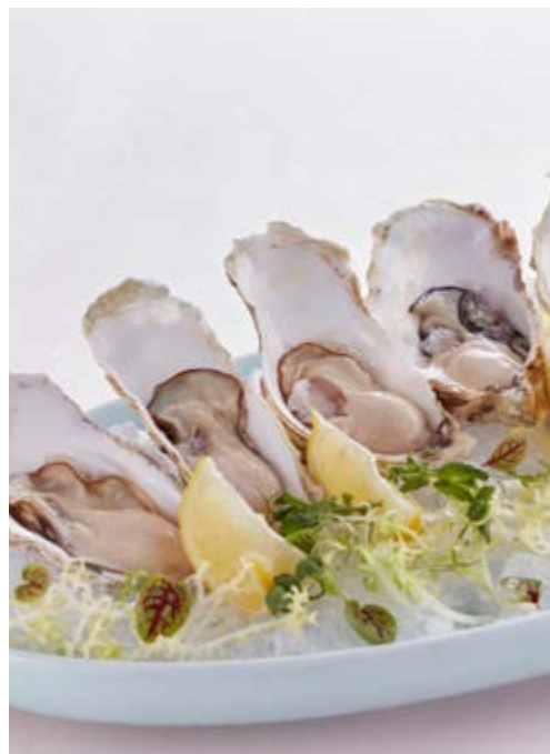
生蚝 Raw Oysters