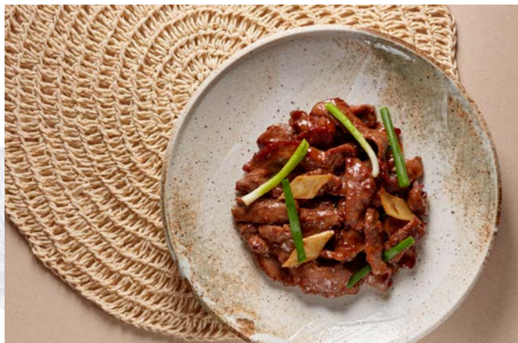
姜葱炒鹿肉 Sautéed Venison Fillet with Ginger and Spring Onion