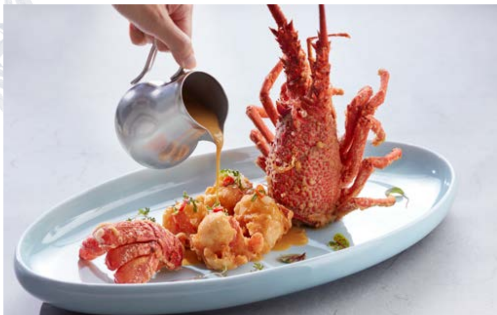
秘制奶皇汁龙虾 Lobster in Signature Creamy Custard Sauce

所有价格均需加收 10% 服务费和现有政府消费税。照片仅供参考。 All prices are subject to 10% service charge and prevailing GST. Visuals shown are for illustration purposes only.